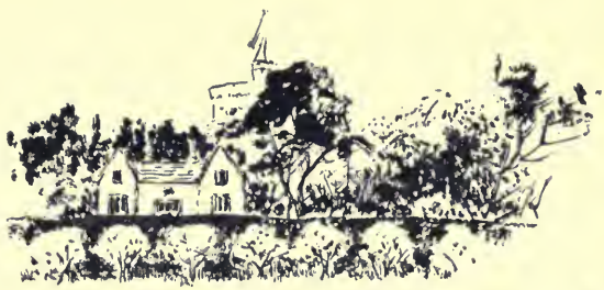
Windsor Castle from Old Windsor